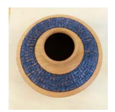
Des T Demo