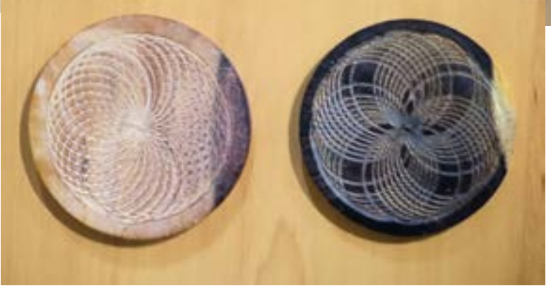
Magic Mushroom Graffiti