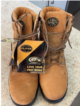
Attachment 3. - OLIVER brand, Wheat, Size 9 1/2, retail approx. $290, Sale price $70,

If anyone is interested please contact Brian Coates on 0433 900 675. If necessary prices could be negotiated.