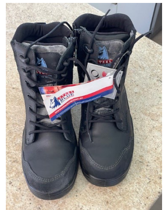
Attachment 2. - STEEL BLUE brand, Black, Zip side, Size 9, retail approx. $170. Sale price $60.