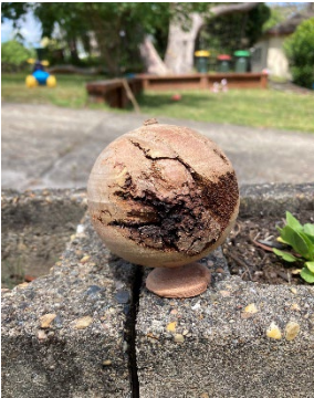
1 First try

We all love our turning and, for the most part, are proud of what we create. But when we snap shots of our creations to share do we know how to set the scene?