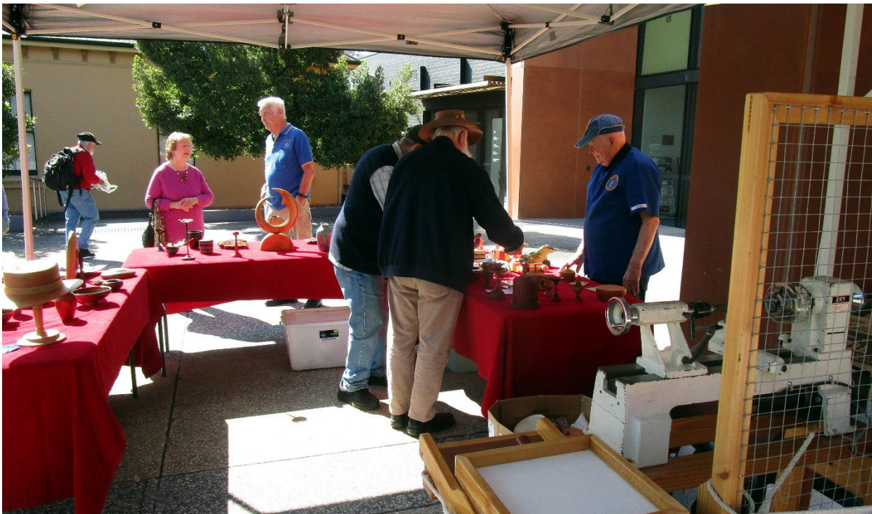
Woodies in action at the Seniors Expo in Springwood October 10, 2024.