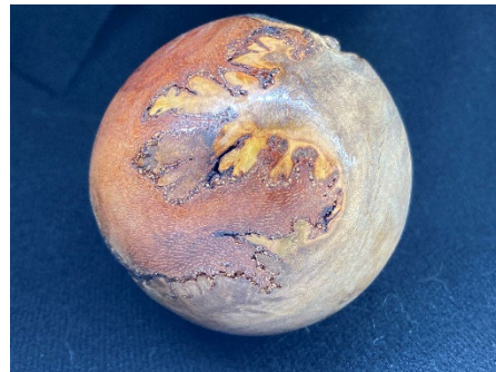
4 Final Fling

I look forward to hearing your thoughts. I think.