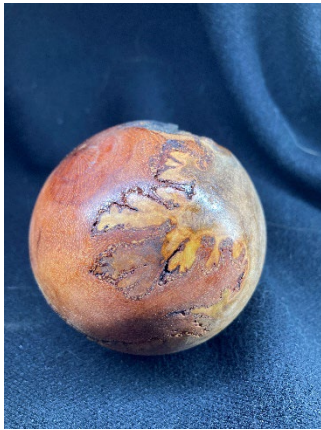
3 Third Attempt

The subject in these photos is a natural edge Mistletoe Sphere I made this week. Remember, we are looking at the composition of the photo, not the flaws in my turning skills.