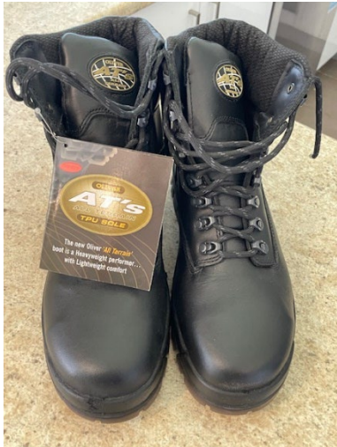
Attachment 1.- OLIVER brand, Black, Size 9, retail approx. $150. Sale price $50.

FOR SALE. Three(3) pairs of brand new steel capped work boots to help raise funds for charity details as follow:-