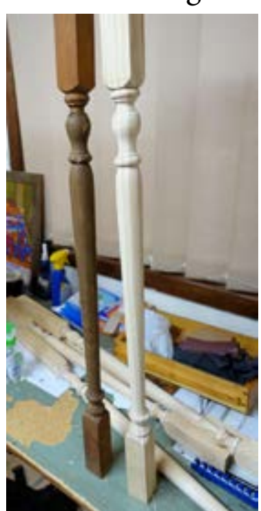
One of Five