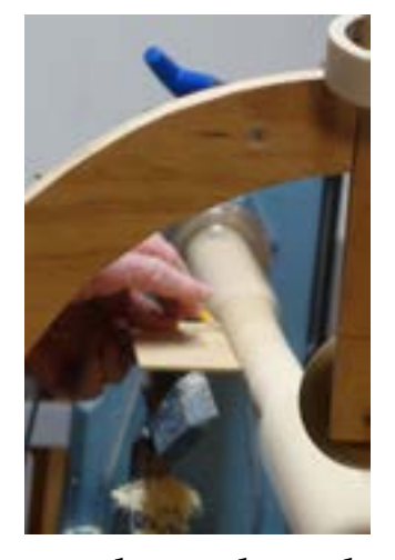
Marking the Job